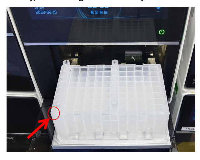
Figure 2. 96-deep well plate

Caution: The user must ensure that the rotatory mixing sleeve is placed properly. Otherwise, the instrument may operate abnormally, or the magnetic rods may be contaminated.