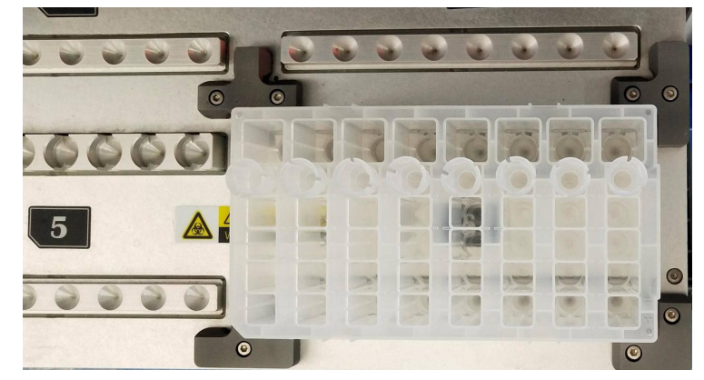
Figure 2. 48-deep well plate

Caution: The user must ensure that the rotatory mixing sleeves are placed properly. Otherwise, the instrument may operate abnormally, or the magnetic rods may become contaminated.