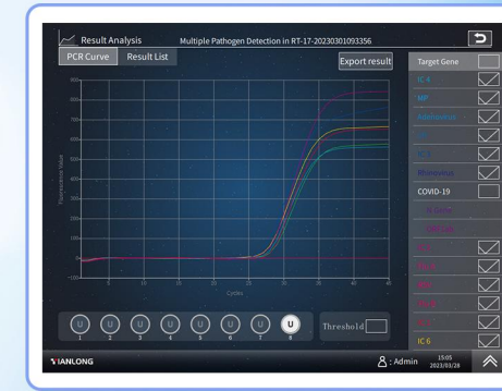
Figure 2: Positive standard amplification curve