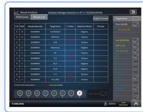
Figure 1: Result analysis on Panall 8000